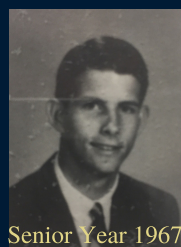
Senior Year 1967